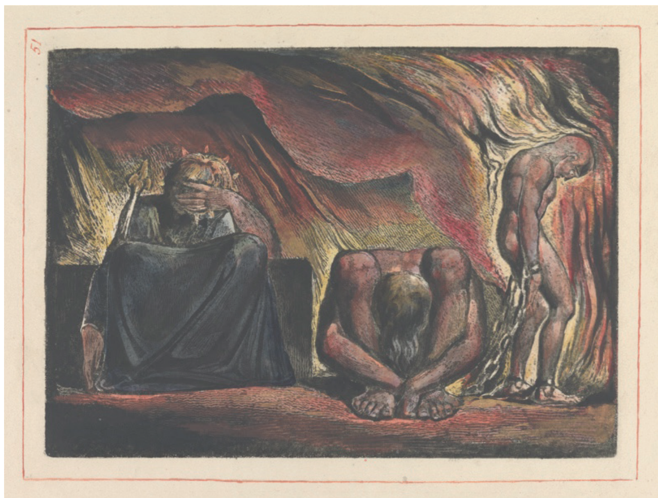
Fig. 2. W. Blake, Jerusalem , 1804-1820, pl. 51.