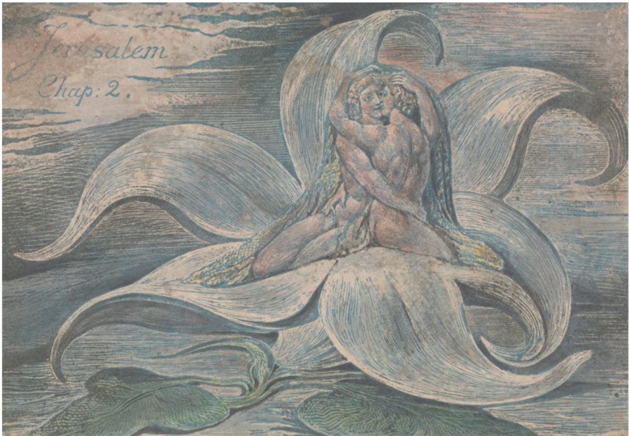
Fig. 1. W. Blake, Jerusalem , 1804-1820, pl. 28.